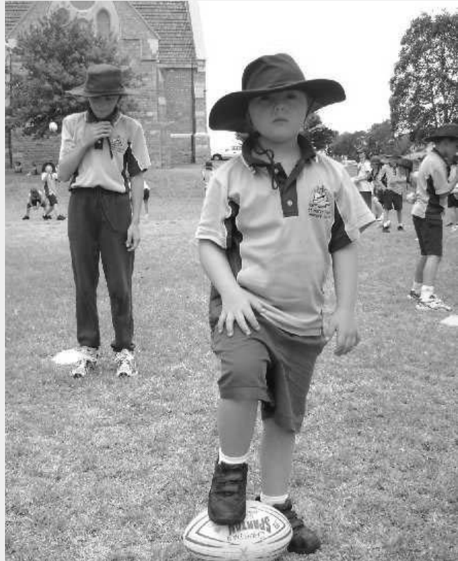
Mayfield Monday 18 November 2019

Come along to learn about inclusive education, hear stories of success from a parent guest speaker and see how inclusion works in the regular classroom