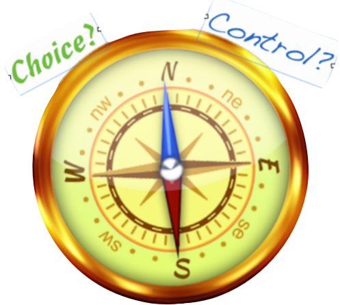
Where is 'true north' for the person?

Try not to think of 'choice and control' as something that services give to people. Think about it as not taking power away from people in the first place. Secondly, think of it as enabling people to make decisions that are connected to their real and deep identity and therefore destiny.