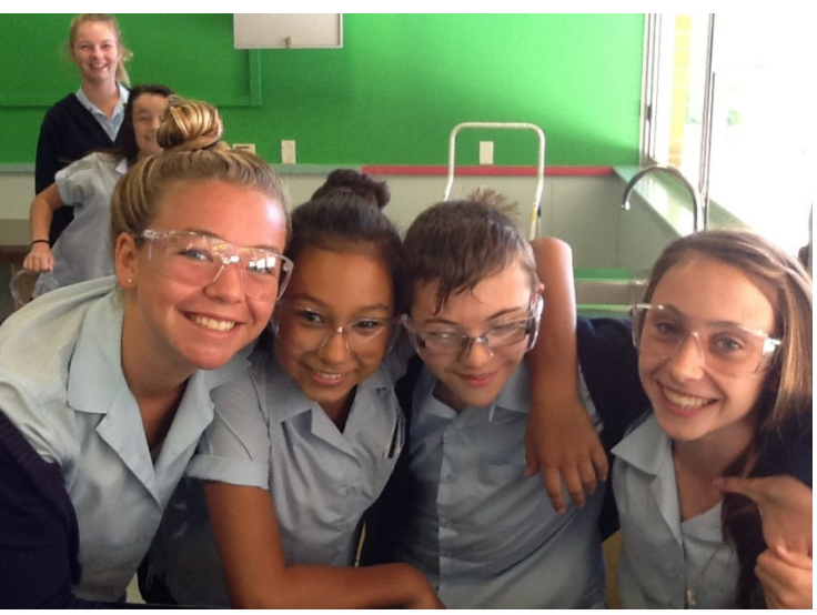
"Children that learn together, learn to live together"