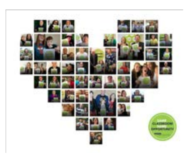
Friends, advocates, allies, people with disability in support of the Same Classroom Same Opportunity Campaign

For several years now, our engagement with the Disability Strategy within the NSW Department of Education continues with a number of advisory roles such as the Disability Strategy Reference Group, and the Student and Parent Experience (SPX) External Stakeholder Advisory Group.