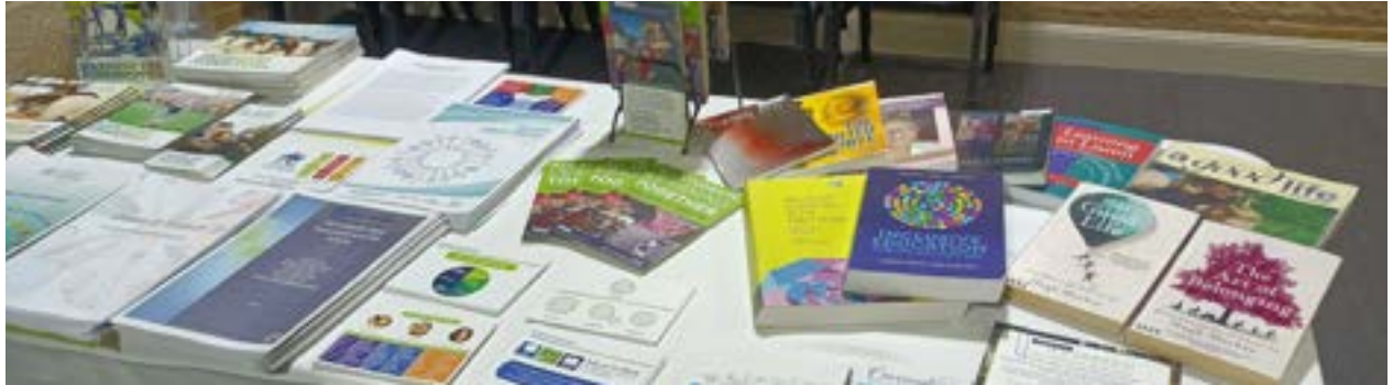
mage: Resource table