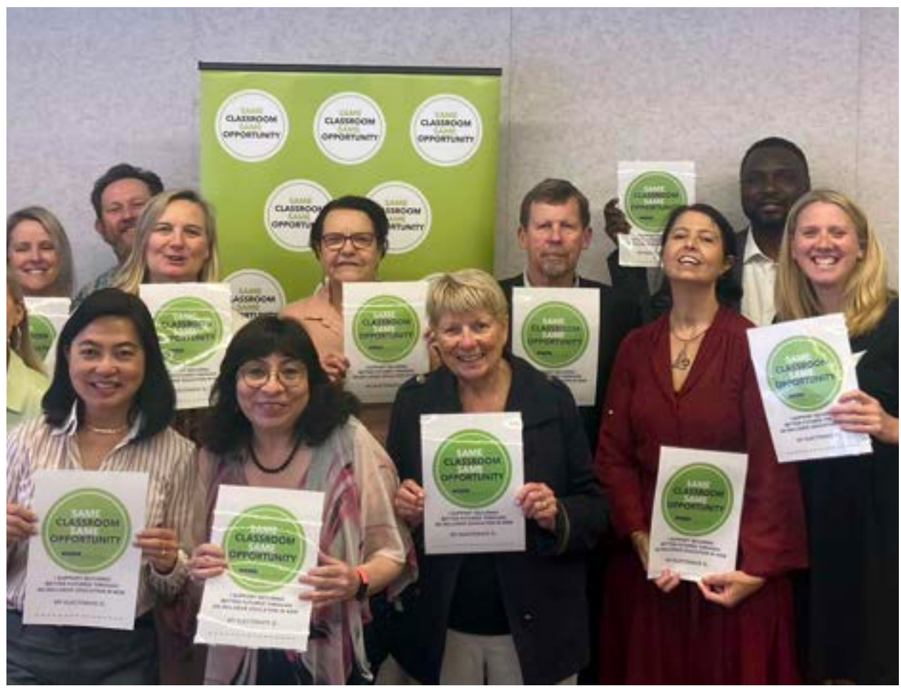
Staff and Management Committee Supporting the Same Classroom Campaign \,