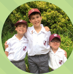
EDUCATION INCLUDING HIGHER EDUCATION